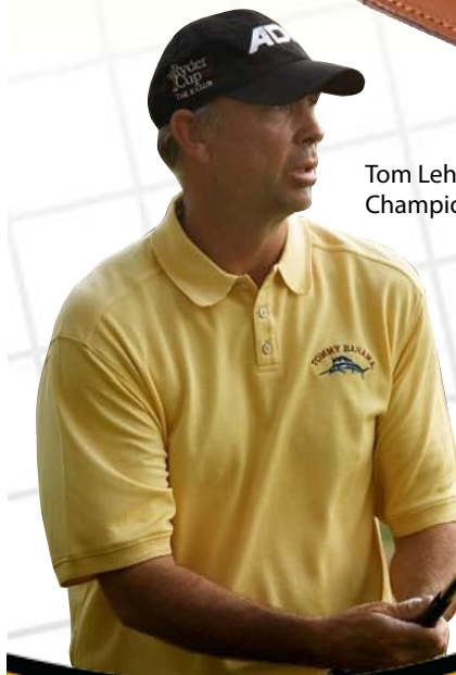
Tom Lehman, Champion Pro Golfer